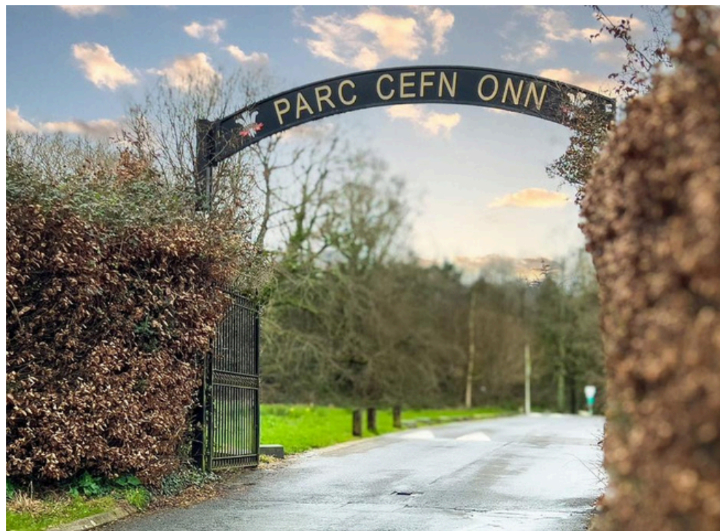
Entrance to the Park